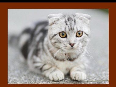
Cats Associate Human Words with Images, Experiment Suggests Phys.org

Researchers at Azabu University found that house cats can associate human words with images, without rewards. They tested cats viewing images with words, showing longer stares and pupil dilation when words were switched, suggesting that cats link spoken words with their surroundings.